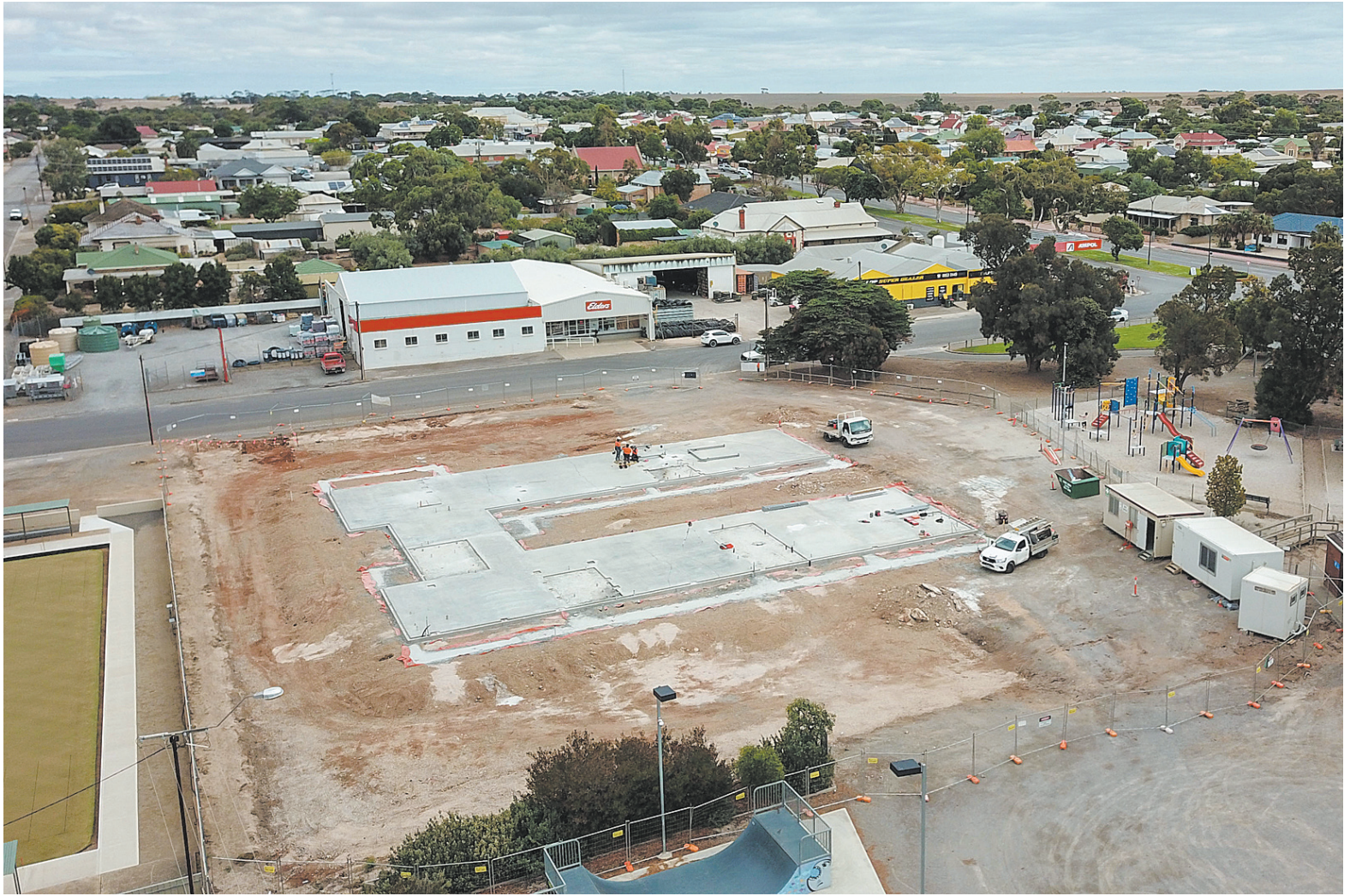
FROM THE GROUND UP... The current state of the Southern Yorke Peninsula Childcare Centre construction work at Minlaton.

“However, if all goes smoothly, Maitland could be open and operational as both a centre and staff training facility sometime this May and the SYP Community Childcare Centre at Minlaton by next January, as previously forecast.”